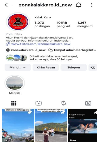
Figure 1. Profile of the Instagram Account @Zonakalakkaro

These emotional responses emerge when users interact with digital content and interpret it based on their experiences, knowledge, and perceptions. In this context, Instagram functions not only as a medium for conveying tourism information but also as a space that shapes users' emotional experiences toward the destinations being presented. Therefore, the interpretation of tourism content on social media is not uniform; rather, it is constructed through diverse affective experiences that vary across individuals.