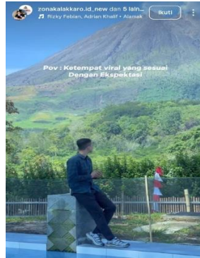
Figure 2. Tourism Post on the Instagram Account @Zonakalakkaro, October 7, 2025: Foursety Lau Kawar Sinabung, Karo Regency

The image above was taken at Foursety Lau Kawar Sinabung and presents a visual representation of a tourist destination that emphasizes natural beauty and an appealing environment for visitors. The aesthetic presentation of photographs and videos serves as the primary attraction capable of capturing followers' attention. From the perspective of Uses and Gratifications Theory, attractive visuals function not only as information providers but also as sources of emotional gratification through immersive visual experiences.