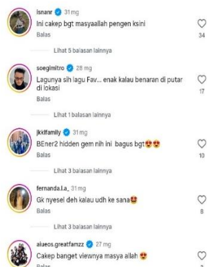
Figure 4. Comments on the Tourism Post Published by @Zonakalakkaro, October 20, 2025: Telaga Sinabung, Karo Regency

Based on interviews with SA, it was found that the visual and verbal elements presented through photographs, videos, and captions on Instagram possess a strong appeal for followers. SA perceived that the content successfully fulfilled their informational needs regarding the featured destinations. Beyond its informative function, the visual content also generated affective responses such as interest, curiosity, and admiration. These emotional responses emerged subjectively, depending on how individuals interpreted the messages, the extent of their informational needs, and their trust in the account as a reference source. The visual beauty conveyed through photographs and videos directly stimulated imagination and emotional attraction toward the destinations, creating a stronger desire to learn about and even visit the locations.