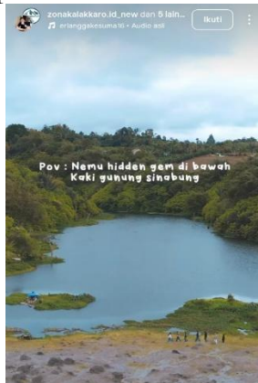
Figure 3. Tourism Post on the Instagram Account @Zonakalakkaro, October 20, 2025: Telaga Sinabung, Karo Regency

The image above was taken at Foursety Lau Kawar Sinabung and presents a visual representation of a tourist destination that emphasizes natural beauty and an appealing environment for visitors. The aesthetic presentation of photographs and videos serves as the primary attraction capable of capturing followers' attention. From the perspective of Uses and Gratifications Theory, attractive visuals function not only as information providers but also as sources of emotional gratification through immersive visual experiences.