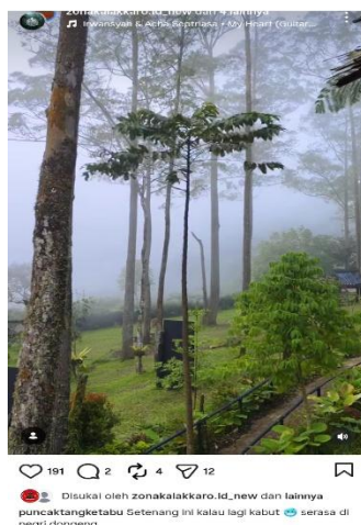
Figure 5. Visual Content of a Tourist Destination on the Instagram Account @Zonakalakkaro, Located in Deleng Singkut, Berastagi

contribute to the construction of followers' mental images regarding the experiences they expect to have before making an actual visit.