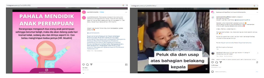
Image 8. Screenshot of the Instagram account @suamiistriromantis, @suamiistriromantis

unknown, with such obligations and responsibilities being transferred to their extended family members.<sup>49</sup> The content above, shared by the Instagram account @suamiistriromantis initiates a discourse about parenting styles and the responsibilities of parents in their children's education. The shared material consists of a film that addresses educating boys and girls, emphasizing the differential nature of their educational needs, as stated in the video's caption. The movie initiates a discourse on how a mother might express affection toward her kid. In addition, the Instagram account mentioned earlier includes a citation of a Muslim hadith accompanied by the statement, "The act of educating girls is deserving of reward."