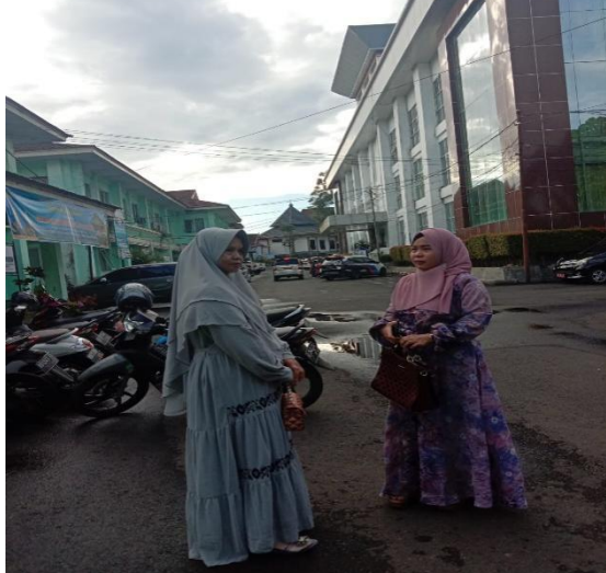
Picture 1 Fill out questionnaires and interviews about religious attitudes and self-regulation

Based on the results of the analysis of the cleaning staff's religiosity questionnaire, namely the Dimension of Faith (Religious Belief) is 99% of cleaning workers say they always believe in the truth of the Koran and Hadith and the existence of heaven and hell and % of cleaners say they often believe in the truth of the Koran and Hadith and the existence of heaven and hell.