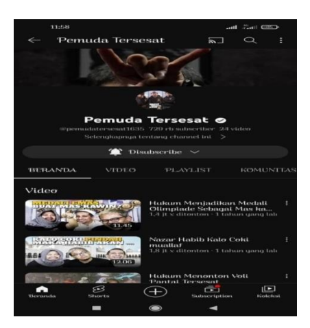
Figure 3. Screenshot of Pemuda Tersesat's YouTube account